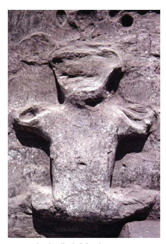
Fig. 4a. Splayed wall relief, found in 1960s excavations (Çatalhöyük Research Project Archive). Photo by Ian Todd . 4a pav. Skulptūrinis reljefas, rastas 1960 m. kasinėjimų metu (Čatal Hiujuko tyrimų projekto archyvas). Ian'o Todd'o nuotr .

Furthermore, as a result of applying different viewpoints and methodologies together with a multidisciplinary team effort, they seem to have more