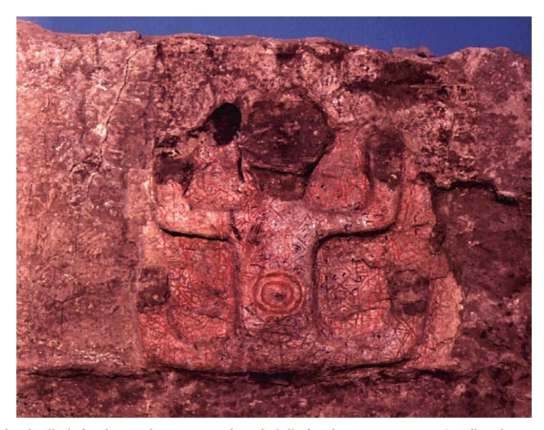
Fig. 4b. Splayed wall relief, with painted concentric circle on the belly, found in 1960s excavations (Çatalhöyük Research Project Archive). Photo by Ian Todd .

4b pav. Skulptūrinis reljefas, vaizduojantis išsikišusį pilvą su pieštais koncentriškais apskritimais. Rastas 1960 m. kasinėjimų metu (Čatal Hiujuko tyrimų projekto archyvas). Ian'o Todd'o nuotr .