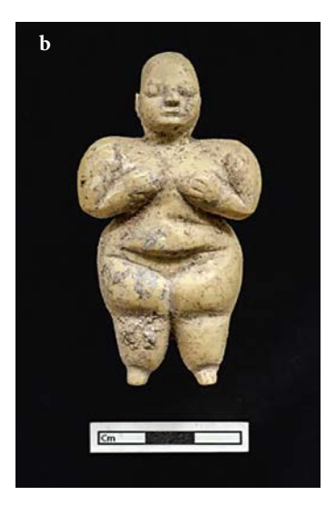
Fig. 1b. Lime stone female figurine found in situ (Çatalhöyük Research Project Archive). Photo by Jason Ouinlan .

1b pav. Klintinė moters figūrėlė, rasta in situ (Čatal Hiujuko tyrimų projekto archyvas). Jason'o Quinlan'o nuotr.