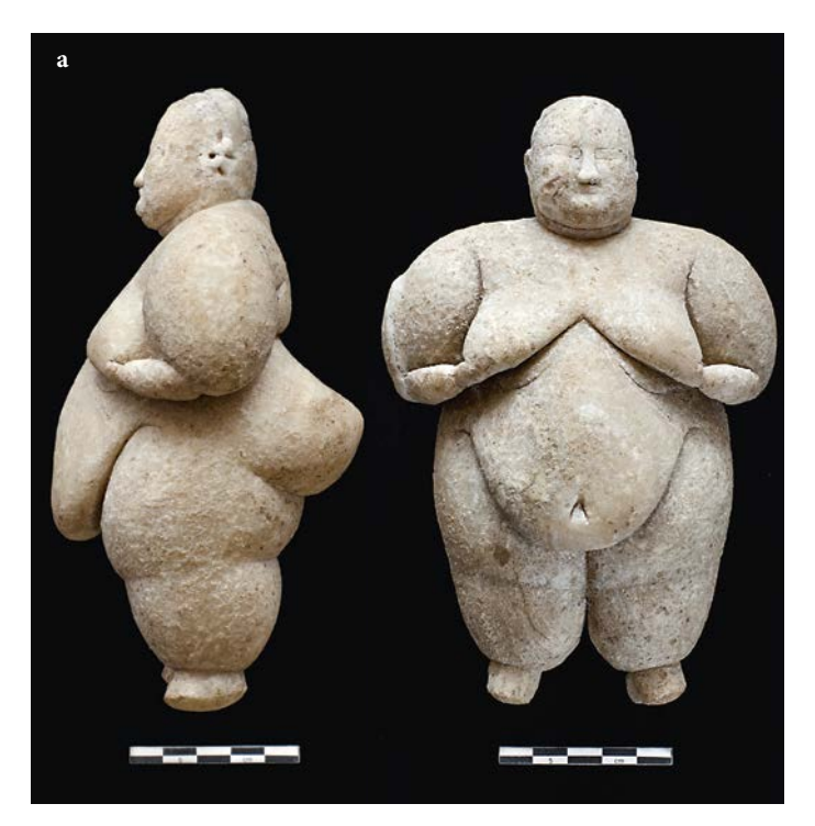
Fig. 1a. Marble female figurine found in situ. 1a pav. Marmurinė moters figūrėlė, rasta in situ.