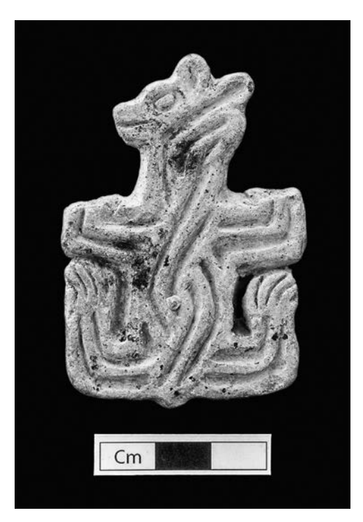
Fig. 5. Clay stamp seal interpreted as bear (Çatalhöyük Research Project Archive).

5 pav. Molinis antspaudas, laikomas meškos atvaizdu (Čatal Hiujuko tyrimų projekto archyvas).