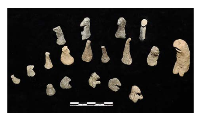
Fig. 2. Group of clay abbreviated figurines (Çatalhöyük Research Project Archive, after Nakamura, C., Meskell, L., 2009). Photo by Jason Quinlan .

Most of the figurines at Çatalhöyük are zoomorphic (54% in total, 35% horned and 19% quadrupeds), followed by abbreviated forms (24%)