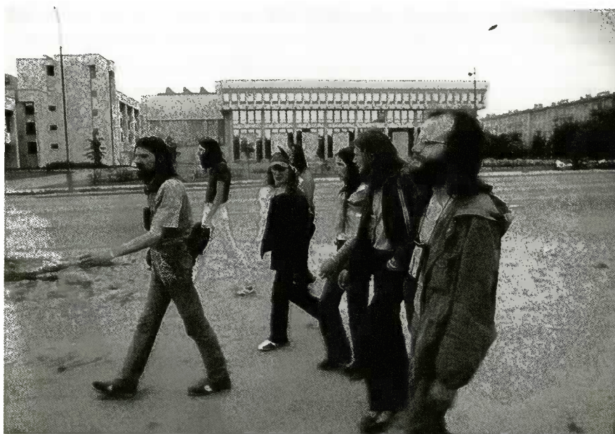
Fig. 7: Hippies in Leninas avenue in Vilnius, early 1980s. LSA, doc. col. K-18, inv. sched. 2, f. 271, p. 51

placed under constant observation by the Soviet authorities. Alternative youth movements were politicised, and Komsomol acted as a defender of the conservative attitudes and interests of the youth. However, neither Komsomol activists nor Communist Party functionaries showed much interest in seeking to better understand these movements, rather holding a very superficial attitude towards them. The authorities simply divided all youth culture into two categories: 1) those who actively helped in building Communism and 2) the disobedient, politically unreliable, “antisocial” youth who were considered “victims of the West”, “dangerous proponents of the bourgeois culture and way of life.” 32 Propaganda and agitation played an important role in shaping the official model of youth culture, and Komsomol paid special attention to the so-called “creative youth” – i.e. young writers, painters, and actors, who also comprised a significant part of the hippie movement. They were one of the main targets of surveillance.