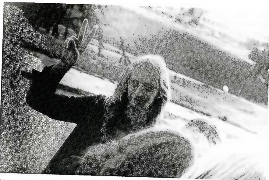
Fig. 6: The Victory sign was one of the signs for hippies to recognise each other, 1970s. LSA, doc. col. K-18, inv. sched. 2, f. 271, p. 35

own slang. Although it appeared as a sporadic phenomenon, the Lithuanian hippie movement in time acquired certain organizational forms, establishing its own identity and structure.