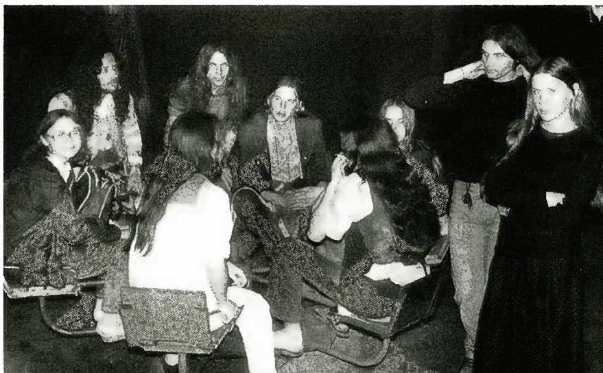
Fig. 1: Gathering of hippies, early 1980s. All the pictures presented in this article are taken from a file of the Kaunas KGB, entitled "Pictures – Hippies, punks in their home environment, at the Hill of Crosses", dated June 6 th , 1970 – summer of 1981. This file includes pictures mainly confiscated from members of the hippie movement or taken secretly by KGB officials

appeared in 1967 5 , but at this stage it was clear that nobody expected this hippie movement to reach the Soviet Union or Lithuania. The members of Lithuania's hippie movement interviewed for this research 6 indicated that the movement began between 1967 and 1970 and ended in the early 1980s. The first records on this movement in the Lithuanian Special Archive ( Lietuvos Ypatingasis Archyvas ; LSA) date back to the beginning of the 1970s; there are no records after the beginning of the 1980s.