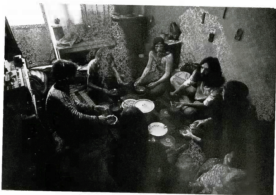
Fig. 2: Hippie community, 1970s.

Due to the lifestyle they chose, hippies were often accused of vagrancy by the Soviet authorities. As is evident from the quote above, hippies tried to avoid such accusations in very inventive ways.