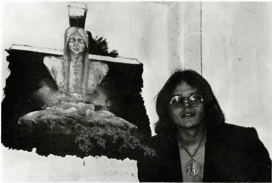
Fig. 4: A Hippie and his art work, late 1970s. LSA, doc. col. K-18, inv. sched. 2, f. 271, p. 68

tives, the cultural forms which were adopted and created by this movement became an expression of opposition to the Soviet regime.