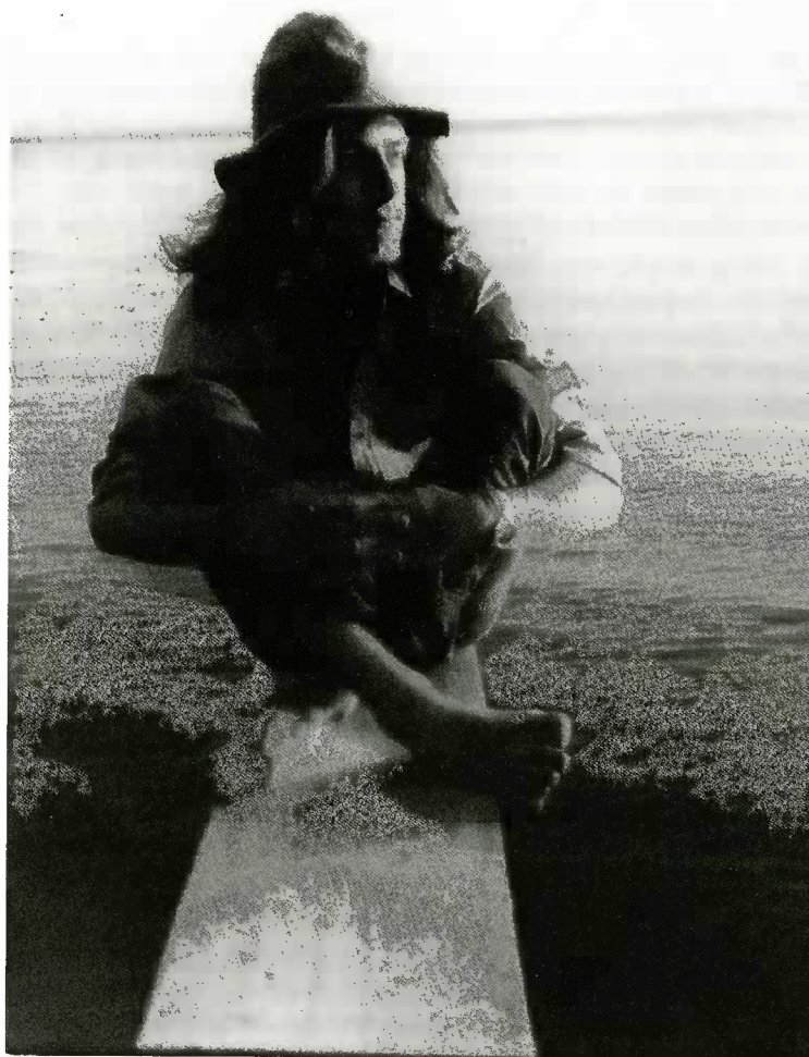
Fig. 8: Portrait of a hippie, 1970s. LSA, doc. col. K-18, inv. sched. 2, f. 271, p. 33

“Mental curing” was commonly practiced in the Soviet Union throughout the 1970s and 1980s, repressing people with different ways of thinking. 34 According to Soviet propaganda, only the insane could be unsatisfied by living conditions in the USSR and protest against the existing order. Thus, by imposing the diagnosis of mental patient, control over society could be main-